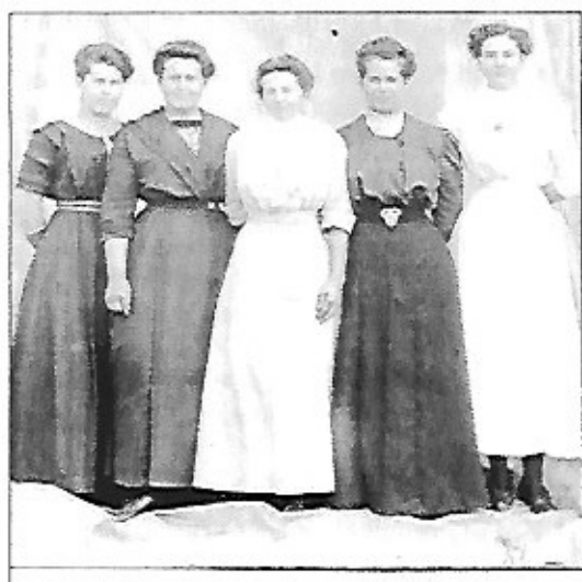
The Zahn Daughters